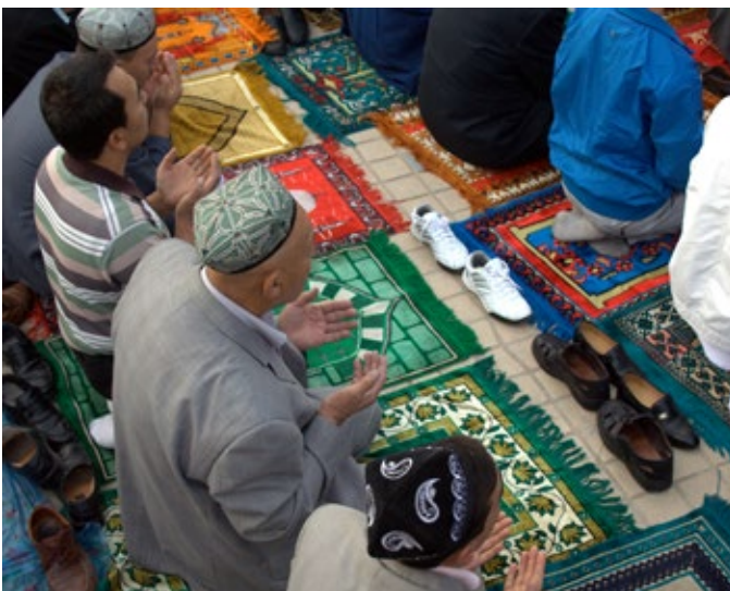
Men Pray at Id Kah Mosque in China, Photo by Preston Rhea, Licensed under CC BY-SA 2.0

Salah (also salaat , namaz ) is the ritual prayer of Islam in which Muslims conform to the will of Allah. Muhammad set the example by purifying and organising what in Pre-Islamic Arabia had become a neglected ritual. The prayer he and his followers performed included ablution, recitation, bowing and prostration. Designated times were set, and prayer was to be conducted in the direction of Mecca ( qibla ). Friday was prescribed as the day for congregational prayer ( Jum'a ).