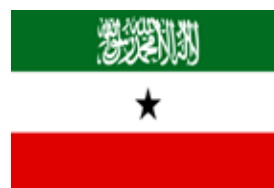
Flag of Somaliland