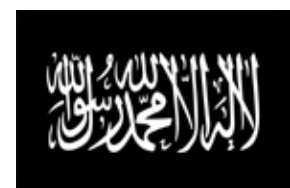
Flag of ISIS, Boko Haram and al-Shabaab