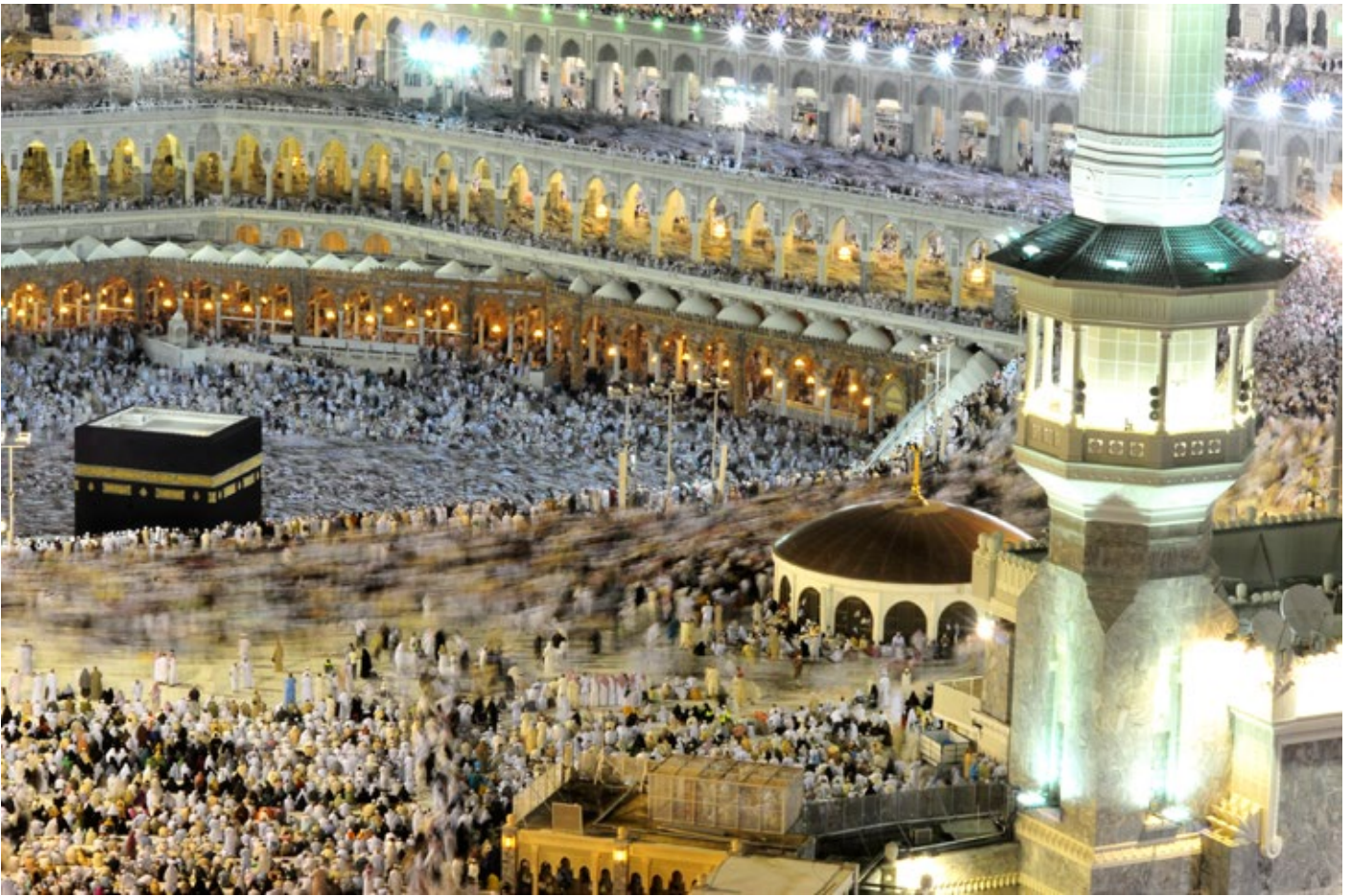
Farewell Tawaf during Hajj

Completing the Hajj, the pilgrimage to the birthplace of Islam, is a duty that every Muslim is expected to perform before he or she dies. It is undertaken in the final month of the Islamic calendar, Dhu al-Hijjah (pilgrimages made at other times of the year are known as umrah ). Although it was once an arduous journey that few Muslims living outside the Middle East would have made, the availability today of air travel, hotel accommodation and organised Hajj trips allows many more to undertake the pilgrimage. A Hajji or Hajja – one who has completed the pilgrimage – is widely respected.