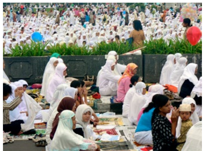
Women pray at Idul Adha in Indonesia, Photo by Chris Lewis. Licensed under CC BY-NC 2.0

Although Friday is a time of congregational prayer and is usually performed, together with a sermon, in a mosque, there are few requirements. In its simplest form, a mosque ( masjid ) is a public space in which ritual prostration can be performed, where the direction of Mecca is indicated ( qibla ), and space is set aside for the imam to give a sermon ( khutba ).