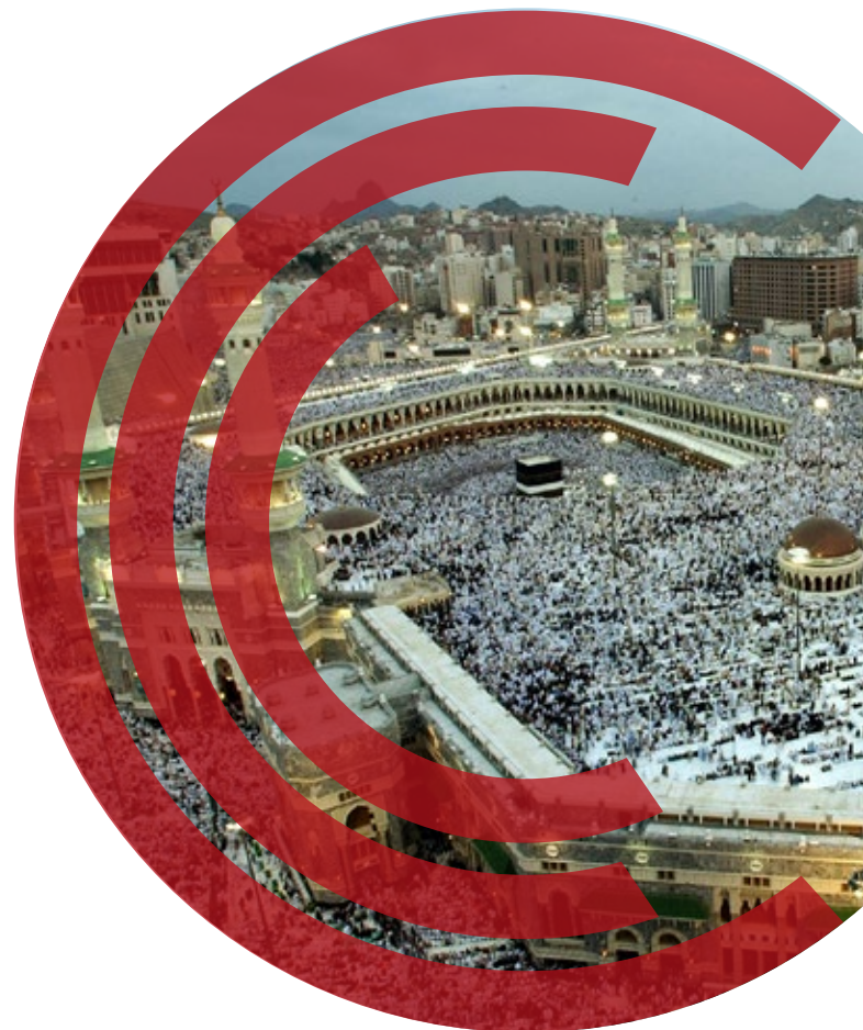
Prayers in Mecca, Photo by Menj. Licensed under CC BY-ND 2.0