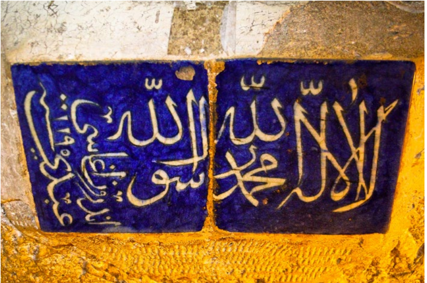
The Shahada in a cave under the Dome of the Rock, Jerusalem